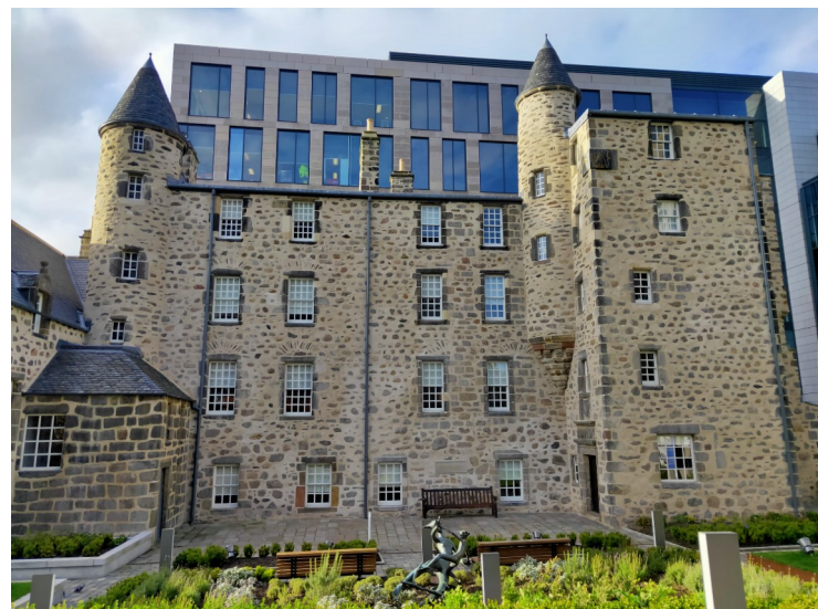
Provost Skene's House

5 min walk • Leave the Marischal Square complex through an old stone arch at the opposite end to which you entered from. Turn right along Flourmill Lane, then left onto Schoolhill, passing between two parts of the Bon Accord shopping mall. The next grand building on the right is the entrance to Robert Gordon's College (private), with Aberdeen Art Gallery immediately beyond.