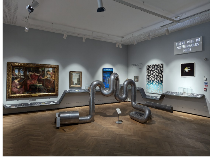
Aberdeen Art Gallery

(1.30pm) Pick a spot on Belmont Street (leading away from the gallery) / Union Street (at the end of Belmont Street).