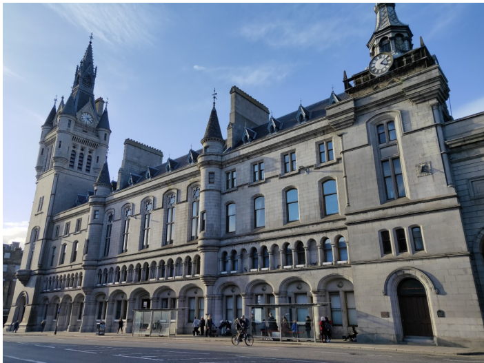
The Tolbooth Museum

15 min walk • Turn left out of the museum. The main road bends left to become King Street, but it's worth continuing ahead to see Castlegate with its 17 th century mercat cross – where new monarchs were announced – surrounded by fine granite buildings. Now retrace your steps, again passing The Tolbooth Museum. Take the next right onto Broad Street. On the right, the magnificent Marischal College was once part of the University of Aberdeen but now the city council HQ. It is the world's second largest granite building. Turn left at the midpoint of the building (opposite the Robert the Bruce statue), passing between modern offices.