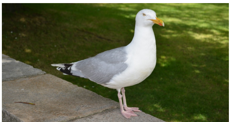
Seagulls are part of any visit to the city!