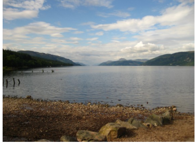
View from Dores

30 min walk • (4.15pm) The superb Falls of Foyers are a breathtaking sight, plunging 140 feet towards the Loch Ness fjord. A short walk downhill from the car park leads to the main viewpoints (paths descend further into the gorge if you have time for a route extension). The scenery seems almost North American in character, with trees towering high above a seemingly bottomless chasm, filled with mist when the river's in spate. Best after heavy rain. Map & photo guide for extended route at sobt.co.uk/walk-falls-of-foyers