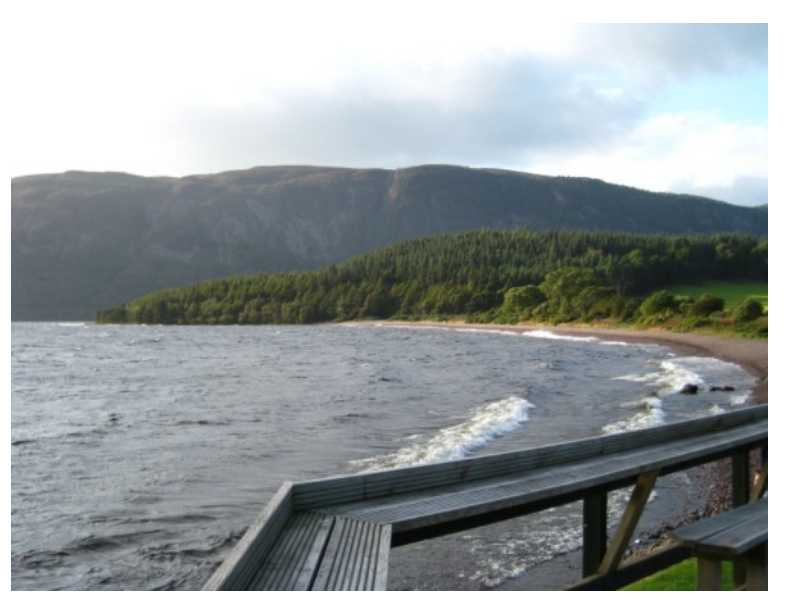
Loch Ness at Dores