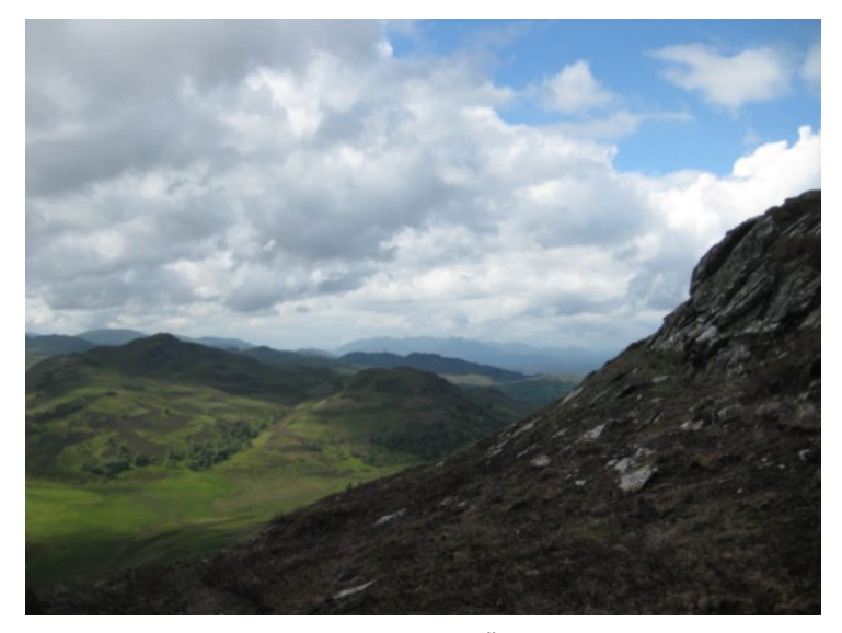
Carn an t-Suidhe

Photo stop • (5.15pm) Dores is little more than a viewpoint and an excellent pub – the outlook over Loch Ness is particularly beautiful at sunset. A camper van / kiosk on the beach belongs to Steve Feltham, full time Nessie hunter – someone give that man a medal! \mathcal{Q} Allow 20 mins.