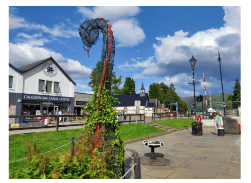
Nessie sculpture, Fort Augustus

★★★★★ unmissable ★★★★ one of the best ★★★ very interesting ★★ interesting ★ minor site